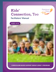
Kids' Connection, Too